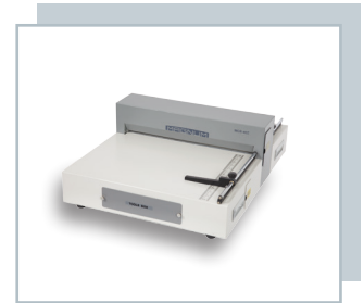
MAGNUM CREASING SYSTEMS