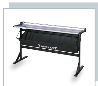
TRIMFAST TRIMMING & CUTTING SYSTEMS