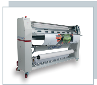
EASYMOUNT WIDE FORMAT SYSTEMS