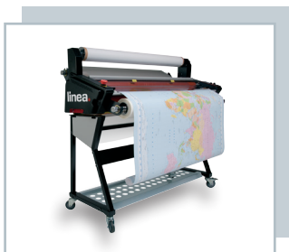
LINEA ENCAPSULATION SYSTEMS