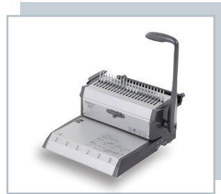
MAGNUM BINDING SYSTEMS