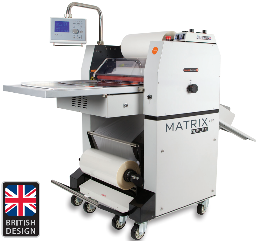
▲ MX-530 DP

The Duplex option is designed and produced in Britain, meaning that our supply chains and lead times are reduced. The highest quality components are used, including Omron switches, Schneider electrics and British built Bambi compressors.