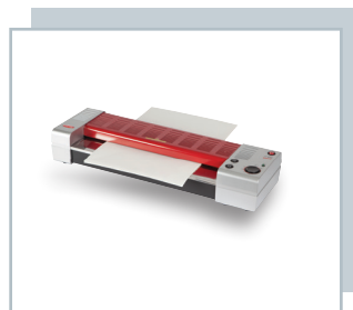
PEAK POUCH LAMINATING SYSTEMS