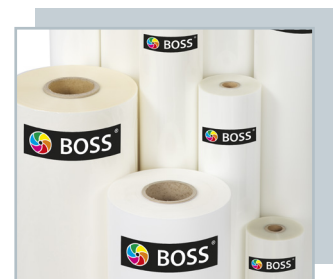
BOSS FILM SUPPLIES

Vivid design and manufacture a wide range of laminating systems, specialising in function, style and reliability.