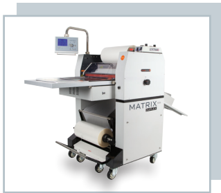
MATRIX LAMINATING SYSTEMS

• Yes - No Non-exhaustive list. Consult us for full stock and availability.